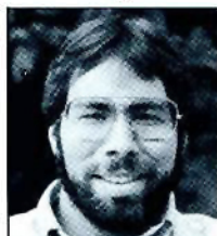
Steve Wozniak, the creator of Apple Computer

GSRAM is available with 256K, 512K, 1 MEG or 1.5 MEG of memory already on board. If you don't need the full 1.5 MEG now, you can choose a GSRAM with less memory and expand it up to 1.5 MEG in the future—or upgrade to GSRAM Plus for a small charge.